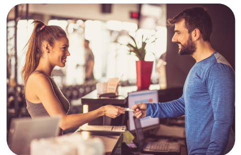
Customer Service Representative